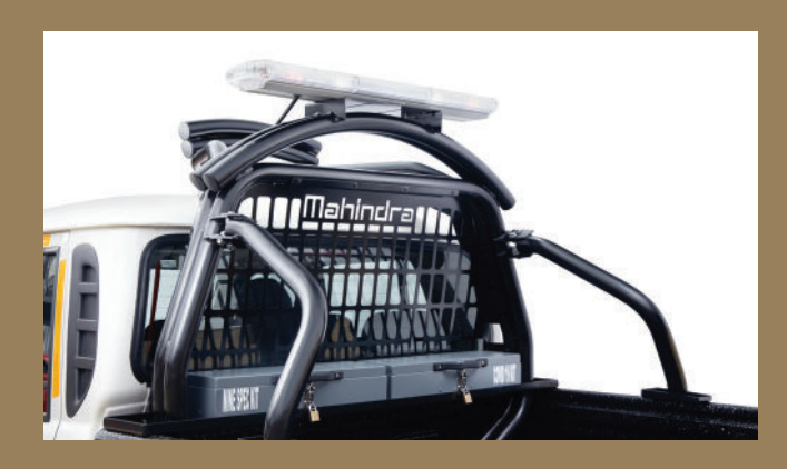
SECURE, LOCKABLE FIRST AID KIT AND COVID-19 KITS