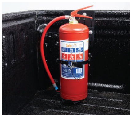
8KG FIRE EXTIN- GUISHER