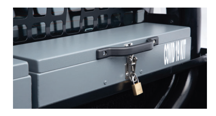
COVID-19 KIT INCLUDED AT NO EXTRA COST